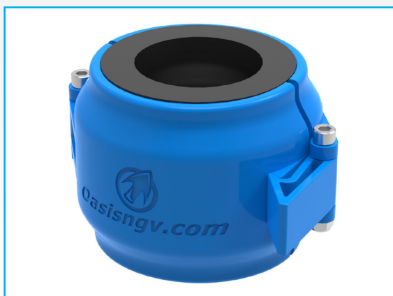
HC308-COVER - 1" Quick Coupler Ice Cover

The Oasis Ice Cover prevents ice build up on the HC308 Coupler while in use in cold climates or high flow applications.