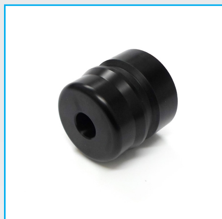
SHC308-18 - Dummy Male