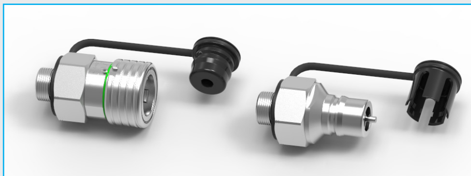
1" Ultra Fast Fill Quick Couplers - SAE thread options

Fast Flow Filling Systems, Storage Cascade to Trailer/Transporter, Trailer/Transporter connection to Daughter station and direct feed to CNG Dispensers. Suitable for CNG, Hydrogen, RNG, Bio Gas, Nitrogen and Air.