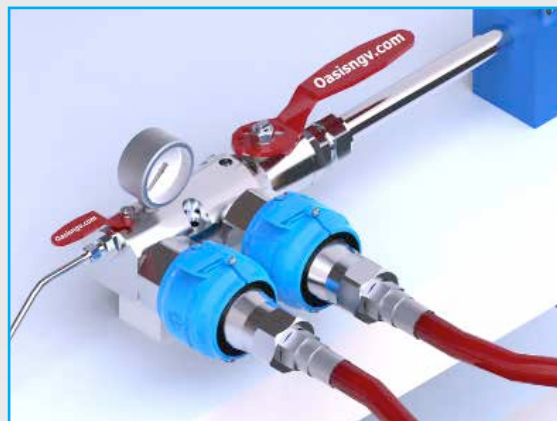
HC308-COVER in use