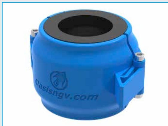
HC308-COVER - 1" Quick Coupler Ice Cover

The Oasis Ice Cover prevents ice build up on the HC308 Coupler while in use in cold climates or high flow applications.