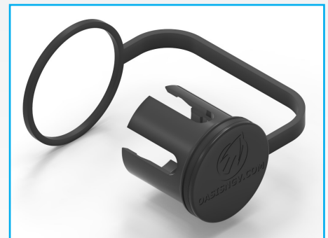
HC308-SDC - 1" Ultra Fast Fill Quick Coupler Male - SAE Male Thread Dust Cap