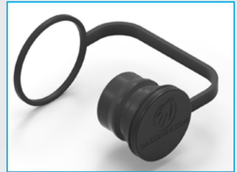
HC308-SDC-F - 1" Ultra Fast Fill Quick Coupler Female - SAE Male Thread Dust Cap