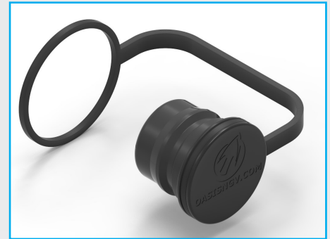
HC308-SDC-F - 1" Ultra Fast Fill Quick Coupler Female - SAE Male Thread Dust Cap