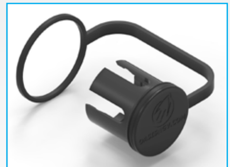
HC308-SDC - 1" Ultra Fast Fill Quick Coupler Male - SAE Male Thread Dust Cap