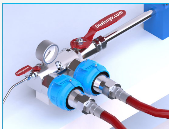
HC308-COVER in use