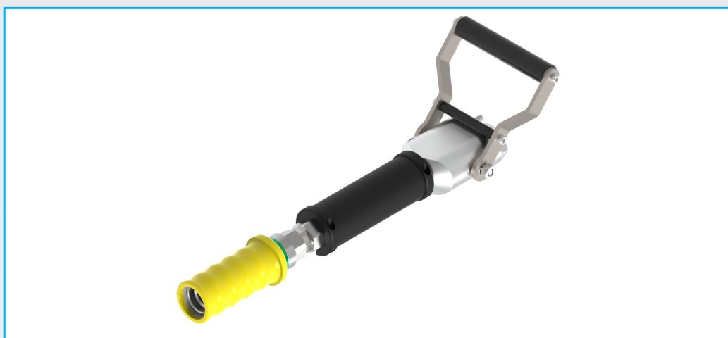
FV103-0-AD6-G - 180° Fill Valve & P36 NGV1 Nozzle

CNG and Bio-Gas dispenser for car, bus and truck filling & CNG and Bio-Gas trailer load/unload systems.