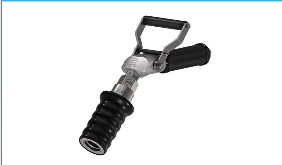
FV103-4-02A-C 45° Fill Valve & NC104-200 Nozzle

CNG and Bio-Gas Dispenser for Bus and Truck filling