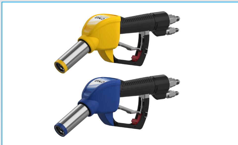
N-CNG P30 (blue) CNG Nozzle with a Type 3 Handle N-CNG P36 (yellow) CNG Nozzle with a Type 3 Handle

Fast fill public and private CNG stations