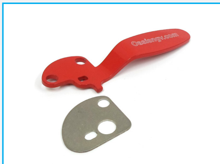
BV702-LH Lock Out Handle and Plate