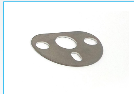
BV703-LH and BV706-LH Lock Out Plates use standard handle (not included)