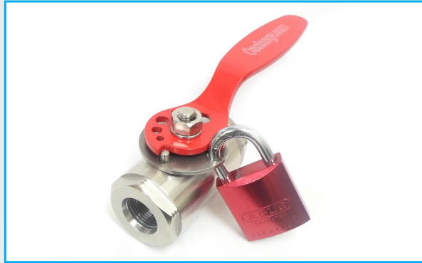
700 Series Ball Valve with Lock Out Option

Suitable for CNG, Hydrogen, Helium, Bio-Gas and Air