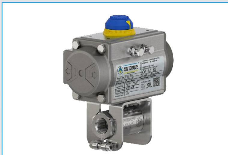
BV704 with Air Torque AT101

Remote ball valve actuation applications such as; Compressor Blow-down, Dispenser sequencing, Isolation, Priority Panels, Storage, Mobile Storage & Transport Trailers. Suitable for CNG, Hydrogen, Helium, Bio-Gas, Nitrogen, Air and other gases on enquiry.