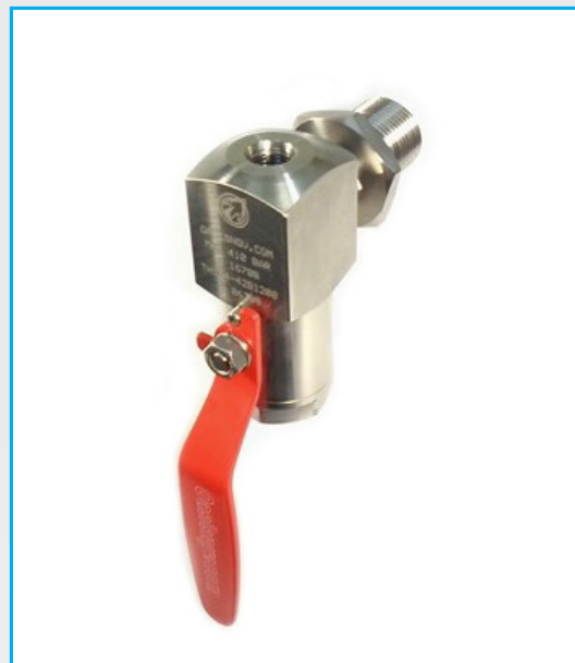
TH104 - 1/2" Cylinder Valve

More product information available online at oasisngv.com/resources .