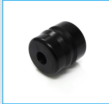
SHC308-18 - Dummy Male