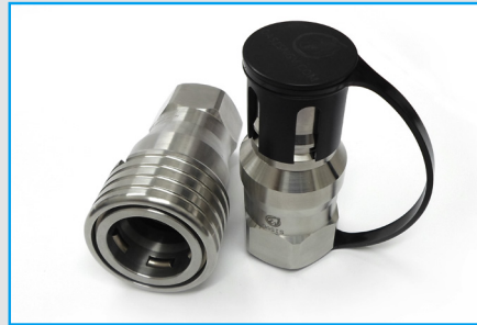
HC308-6NDDN - 1" Quick Release Coupler

Fast Flow Filling Systems, Storage Cascade to Trailer/Transporter, Trailer/Transporter connection to Daughter station and direct feed to CNG Dispensers. Suitable for CNG, Hydrogen and Bio-Gas.