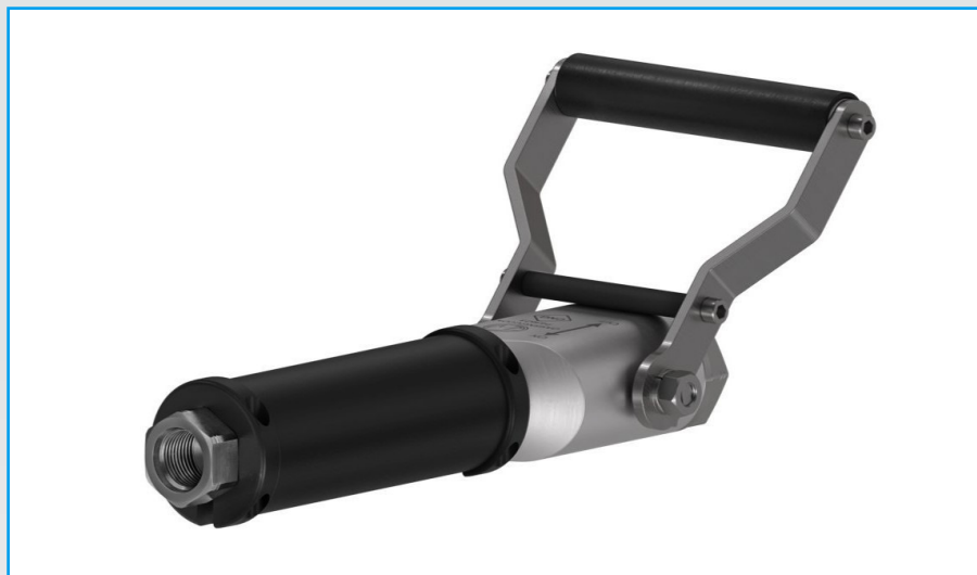
FV103-0-AA6-0 180° Fill Valve

CNG and Bio-Gas dispenser for car, bus and truck filling & CNG and Bio-Gas trailer load/unload systems.